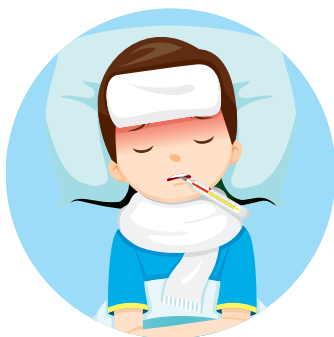
a fever that will not go away

Children with COVID-19 may have mild, cold-like symptoms, such as fever, runny nose, and cough, and some children experience vomiting and diarrhea. Occasionally, a child gets really sick after being infected with COVID-19. There have been some rare reports of children who have multi-system inflammatory syndrome, which can be serious and may require treatment in the hospital. Call your medical provider if your child has any of the following symptoms: