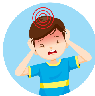
confused or overly sleepy