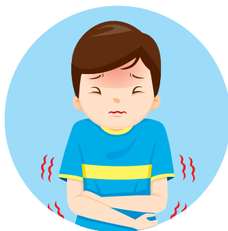
abdominal pain, diarrhea, or vomiting