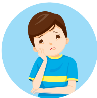
pink or red eyes